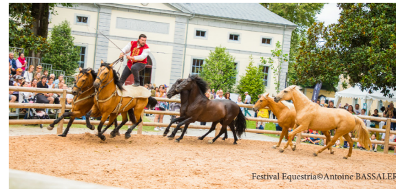
Festival Equestria