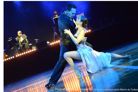
Festival Tarbes en Tango