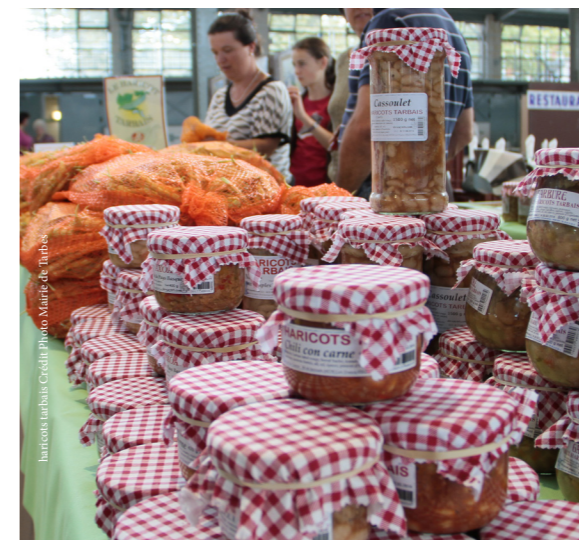
banques tarbais