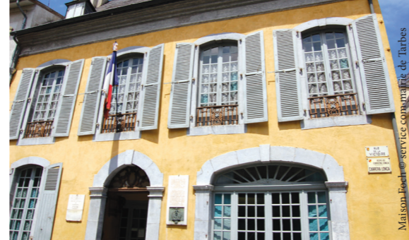
Maison-Écurie service com.mairie de Tarbes