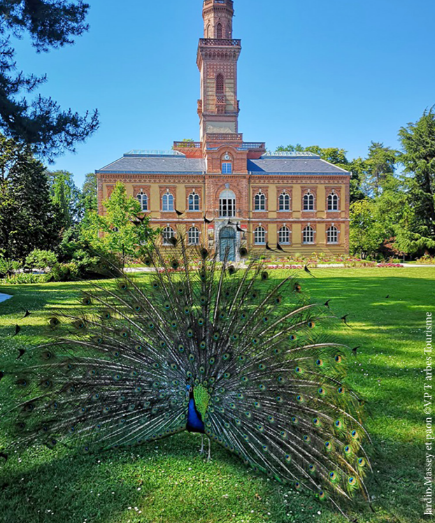
Jardin Massey et Jardin