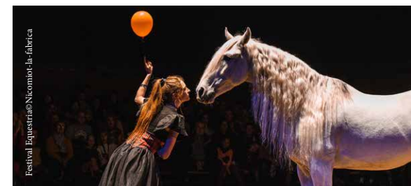
Festival Equestria

Price: 20 € per carriage + price of lunch according to the menu