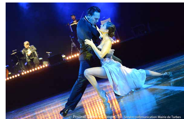
Festival Tarbes en Tango