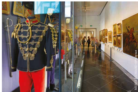
MUSÉE HUSSARD de Puyot