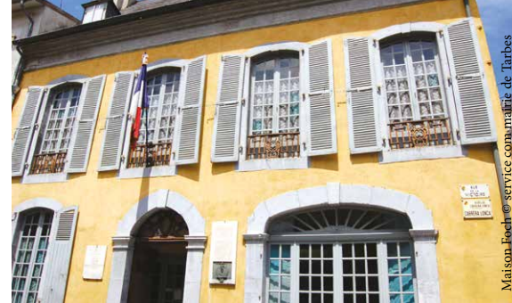
Maison Foch service com. mairie de Tarbes