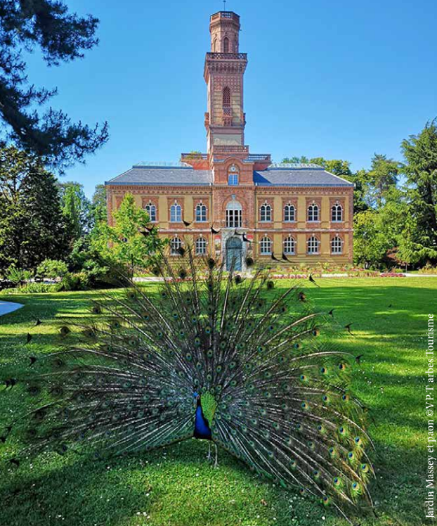
Jardin Massey et piano